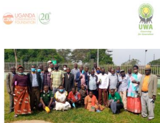
KATWE, NYAKATONZI, ISANGO, NYAKIYUMBO AND KAHOKYA PARK- COMMUNITY COMMITTEES INAUGURATIONS

A total of 162 PCC members from seven (7) districts adjacent the QECA were brought to Mweya for the above purpose, including; Kanungu District (12 members), Rukungiri District (12 members), Mitooma District (18 members), Rubirizi District (30 members), Ibanda District (6 members), Kitagwenda District (18 members) and Kasese District (66 members).