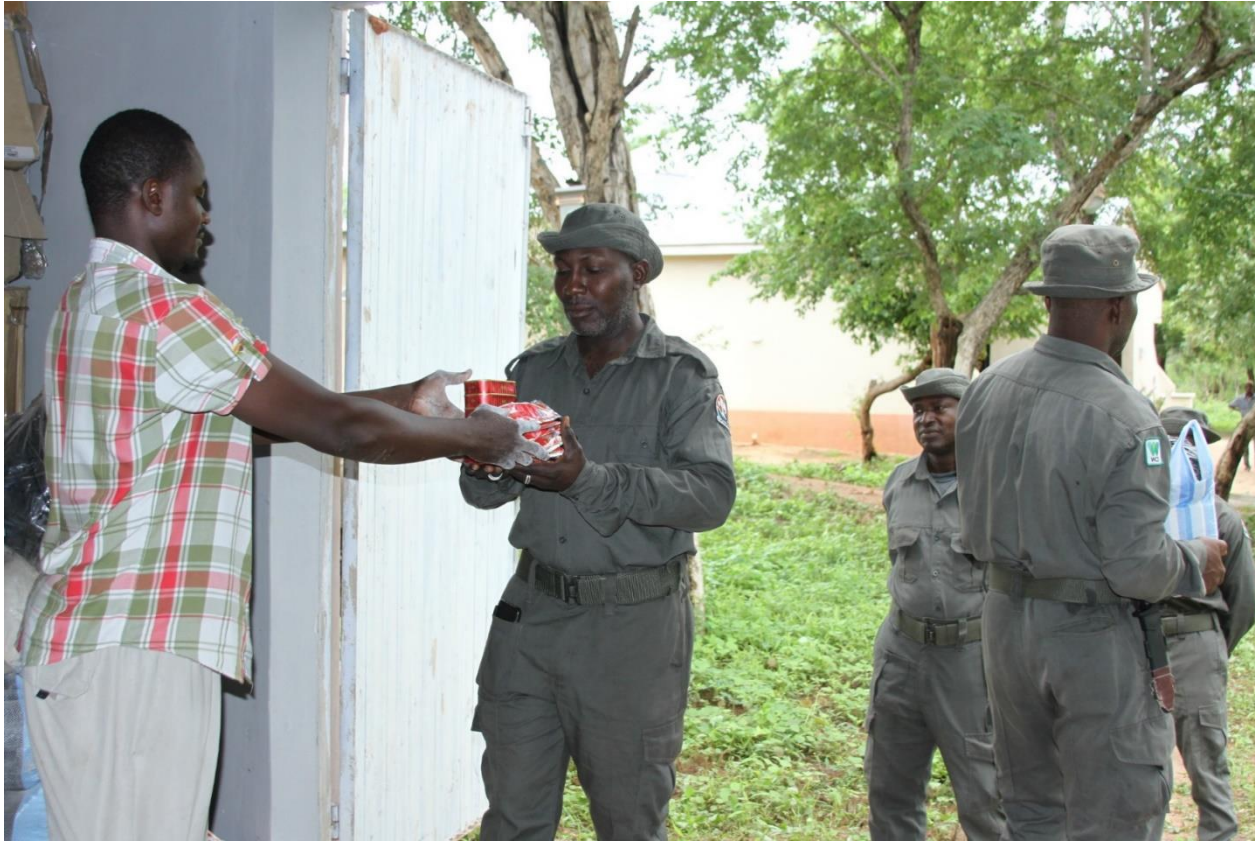
Figure 2: Patrol team leaders collecting field rations before setting off on patrols for the week