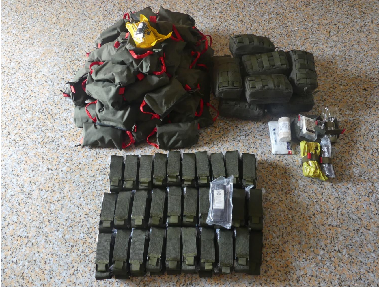
Figure 3: The first aid kit items received and ready for distribution include 12 full first aid kits, 60 tourniquets with pouches and 60 compression bandages