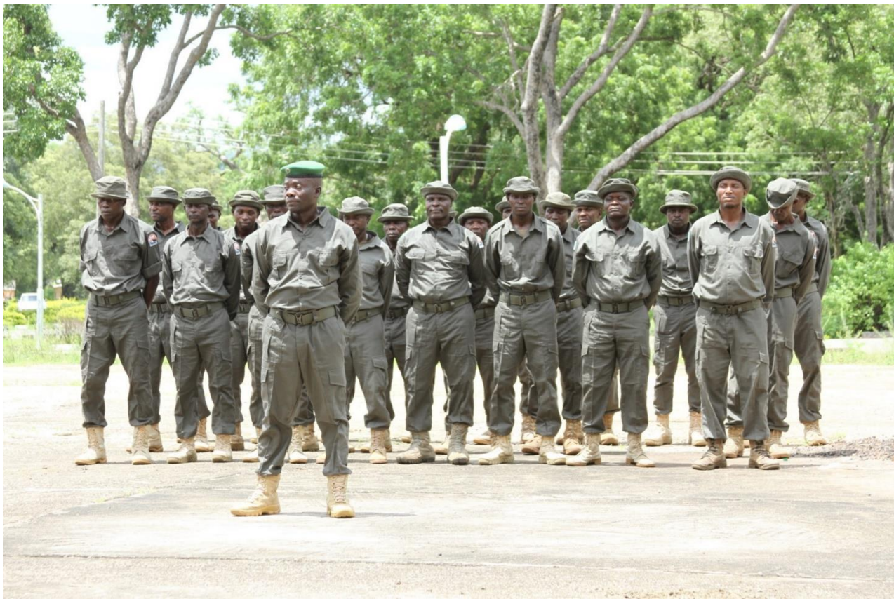
Figure 1: Rangers on parade