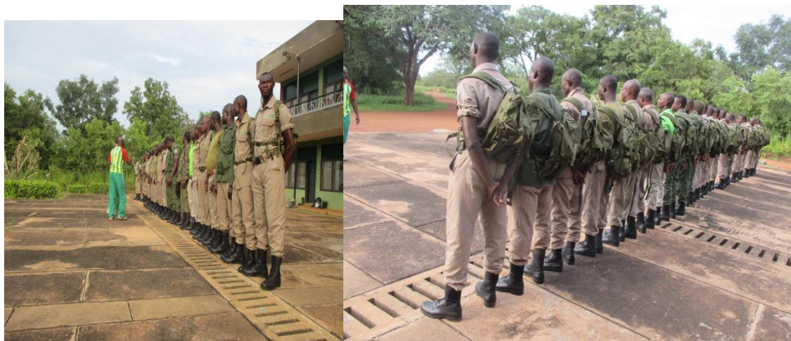
Rangers undergoing training

During the Month of October, 2016, 80 Rangers (Law Enforcement Staff) were taken through rigorous two weeks training, made of field craft, fitness/body building, First Aid, weapon handling and wildlife Laws and patrol systems. They were then deployed for practical field patrols to demonstrate what they were taught during the two weeks. The first session of the training successfully ended on October 26, 2016. A second batch of 40 have been scheduled for the next training session in November, 2016