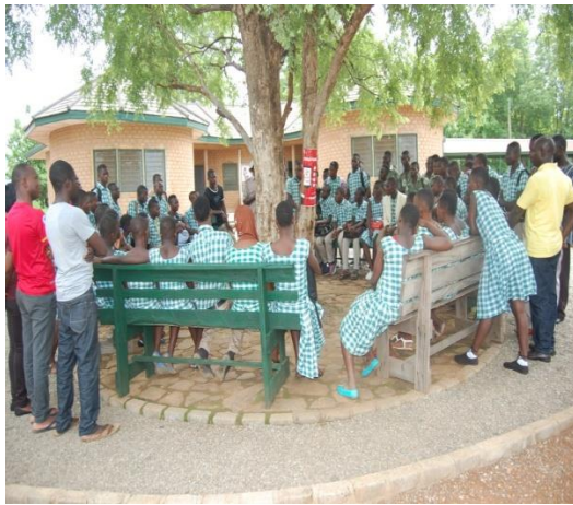
At Mole visitor Centre

So far seven schools participated in this programme include: Larabanga (3)JHS and Kananto (1)Primary School, mognori (1)primary, Murugu (1) primary and (1)JHS with a turnout of 1045 participants. However, three other schools were visited for familiarization and setting up wildlife clubs.