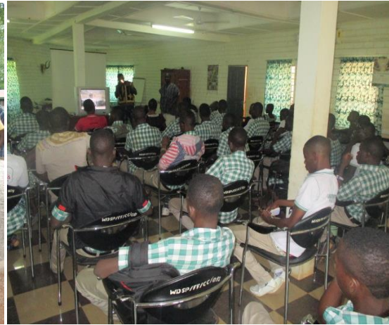
Lecture in Mole Conference room