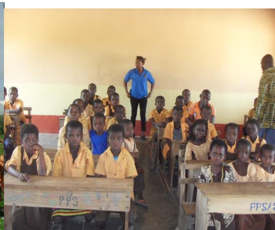
Left: Excursion to Mole NP (Viewing Elephants in Mole NP). Right: Interacting with Wildlife Club in sch.